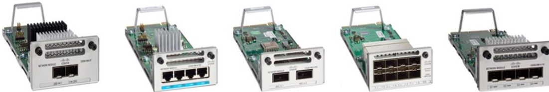
Figure 3. Cisco Catalyst 9300 Series Network Modules