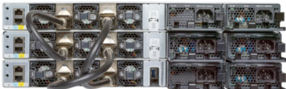
Figure 6. Cisco Catalyst 9300 Series fixed uplink models with optional stack kit