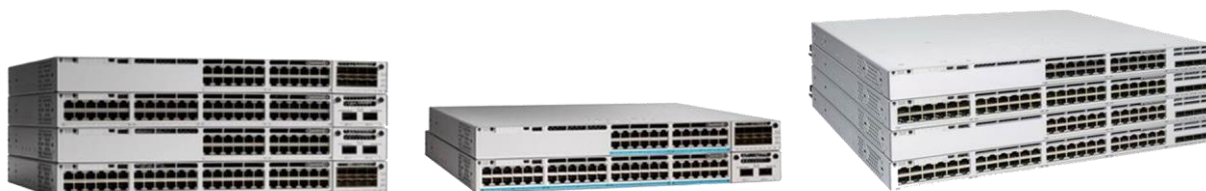
Figure 1. Cisco Catalyst 9300 Series switches

The Cisco Catalyst 9300 Series is made up of nineteen modular uplink switch models and fourteen fixed uplink switch models.