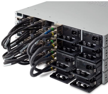
Figure 7. Cisco Catalyst 9300 Series StackPower